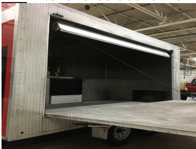
Exterior area above the medal flap/diamond plate/stage

___ Clean the outside of the unit with cleaner you would use on fire apparatus and or the Krud Kutter provided.