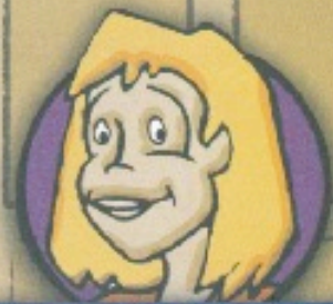
MARY MEETING PLACE