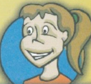
TWO WAYS OUT SCOUT